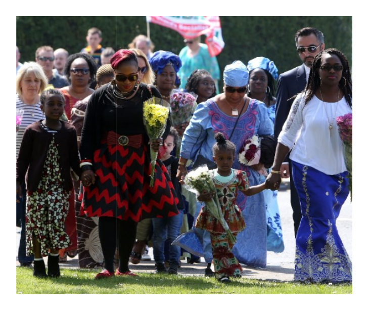
Galatians 3:28 28 - There is neither Jew nor Gentile, neither slave nor free, nor is there male and female, for you are all one in Christ Jesus

SCESOAOSSNN LNOHR TNE U S Ν Т Ε Ε Т H U 0 Ε LCAR Ν G Ε