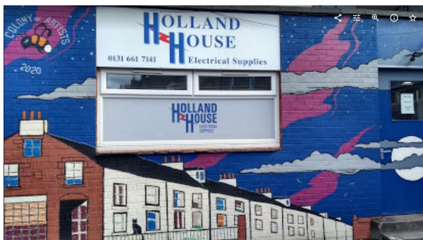
2020—painted on walls of a commercial unit in Rossie Place